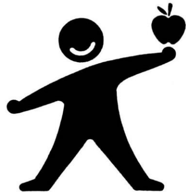
Do it Daily...For Life!